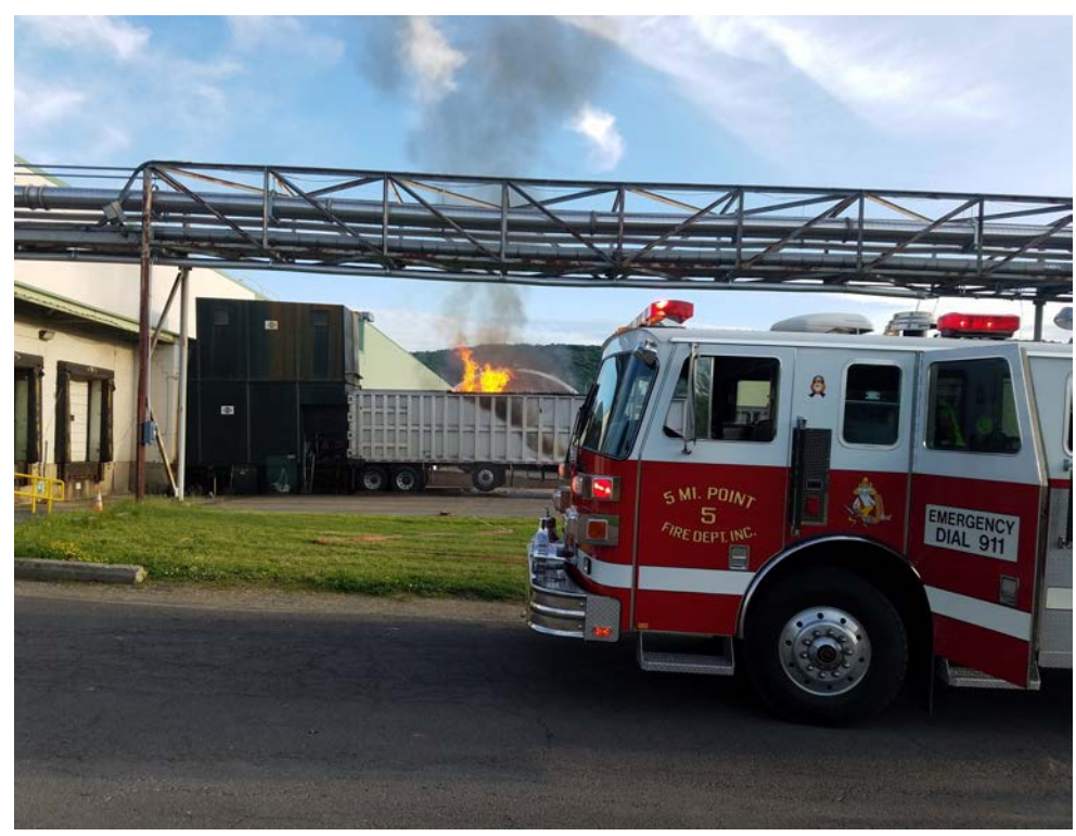
N. Griswold Photo- Engine 59-1 arrives on scene.

At 19:08 Hours on the evening of June 9th, 2018, Broome County Communications dispatched the Five Mile Point Fire Department (59) to 10 Spud Lane, Frito Lay, for a possible compactor fire at the rear of the building. Initial reports were that there was smoke visible from the compactor but no fire seen. Chief 59B went enroute and arrived to find a full size open top tractor trailer backed up to a compactor attached to the rear of the building with smoke and fire showing. Chief 59 then requested county re-dispatch the incident as a working compactor fire.